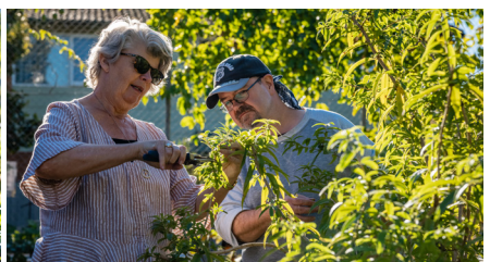
RSIS recipient "Reducing Social Isolation for Seniors Round 1 - Mission Australia Housing Project"